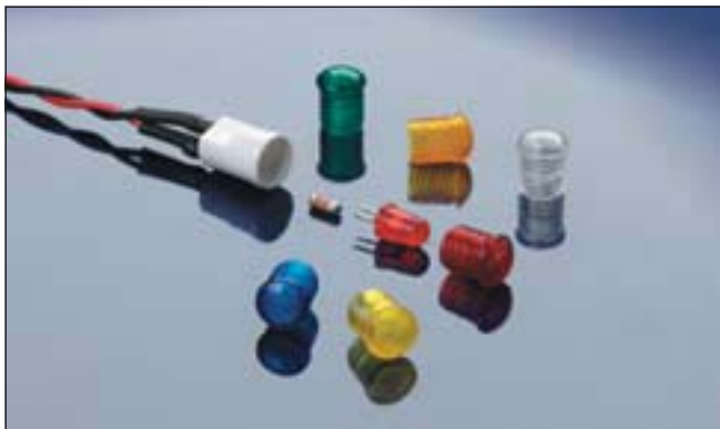
U.S. & Foreign Patents Issued and Pending